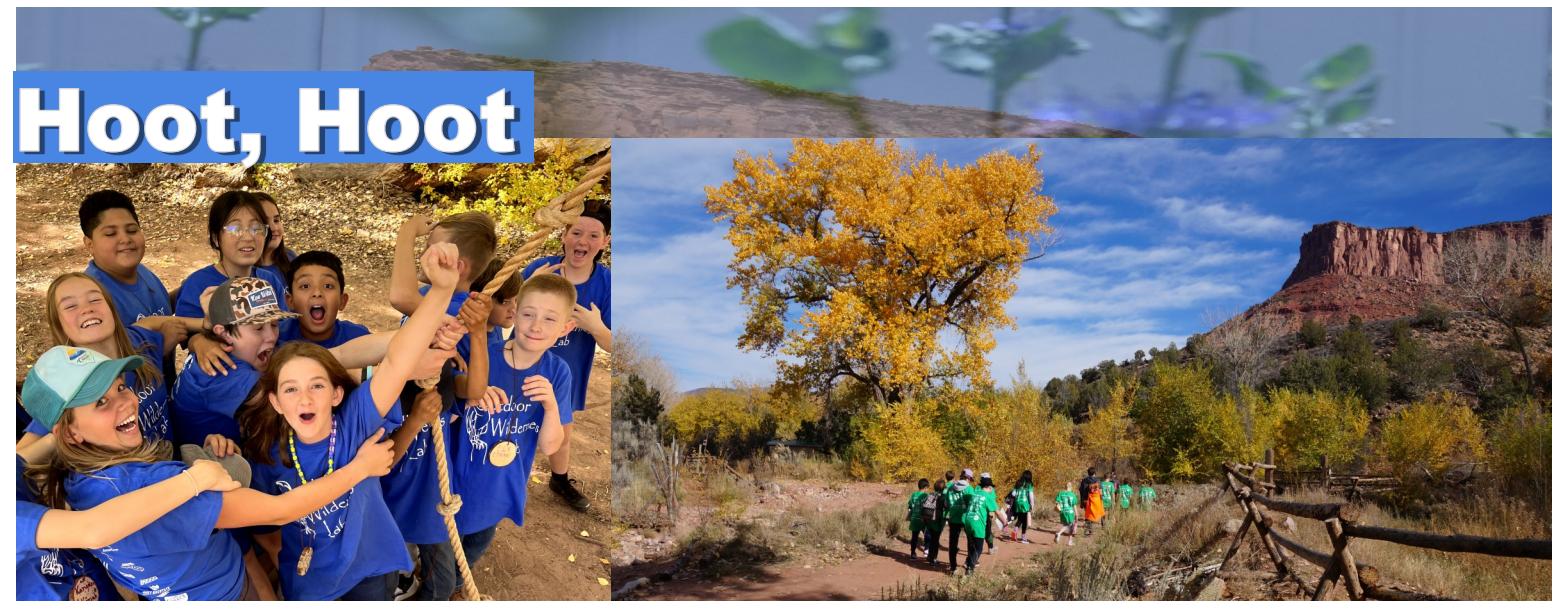
Dear Gateway School Community,

As we bid farewell to the fall semester, it is with immense pride and gratitude that we reflect on the impact our campus has had on students during these past few months. Our campus has created a nurturing environment that fosters growth, resilience, and success.